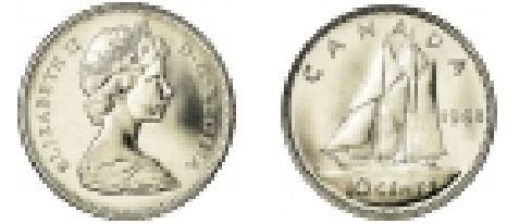
1968 Varieties: Ottawa Mint (up) vs Philadelphia Mint (bottom).

Due to a lack of time, the Royal Canadian Mint made arrangements with the United States Mint at Philadelphia to strike many of the nickel 10-cent pieces for 1968. The Ottawa and Philadelphia strikings differ only in the number of reeds on the edge and shape of the slots between them.