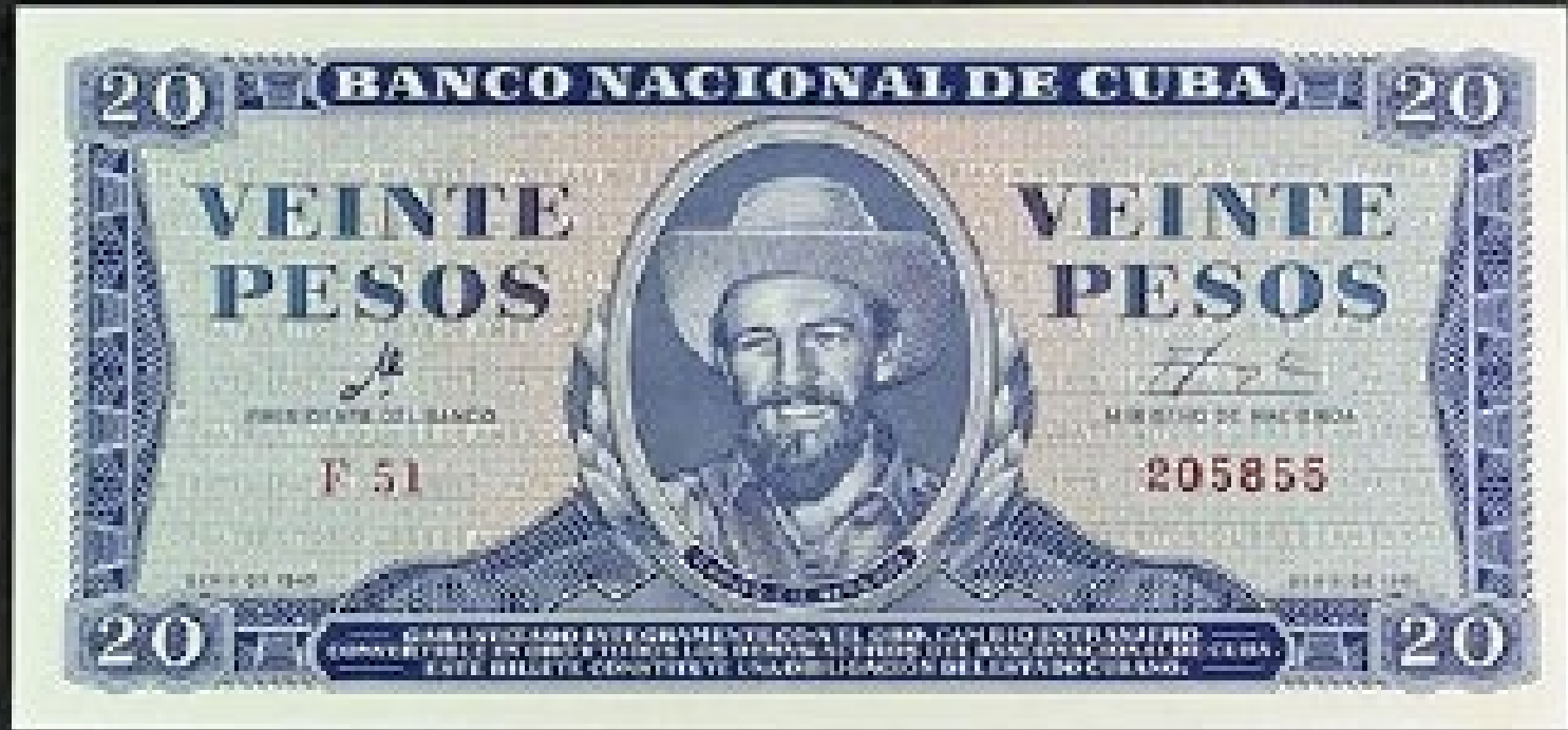
Actual 97a Note produced by the Cuban Government